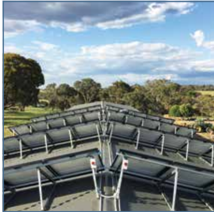
TOWARDS TOMORROW ENERGY