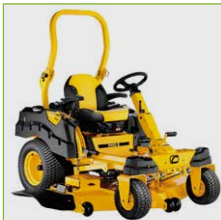
HIGHLANDS OUTDOOR POWER AND PUMPS