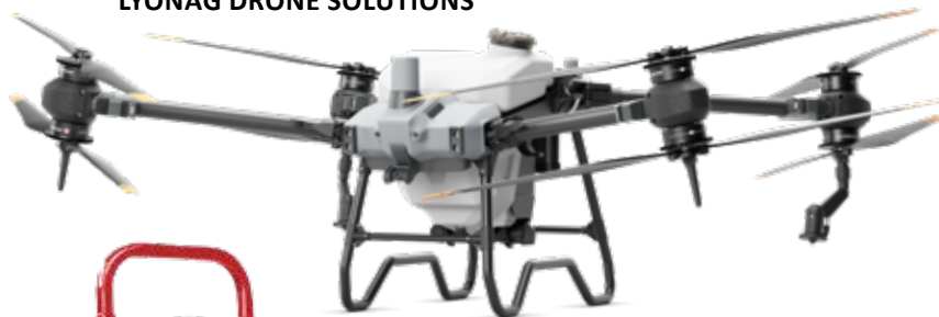
LYONAG DRONE SOLUTIONS