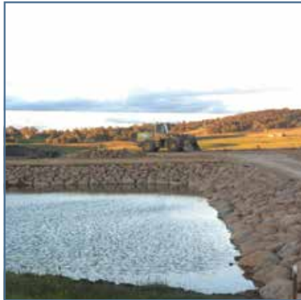
DIVALL'S EARTHMOVING AND HAULAGE