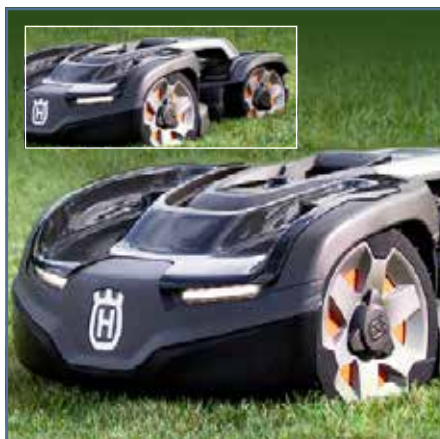
HIGHLANDS OUTDOOR POWER AND PUMPS