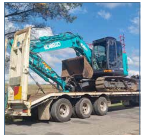
AG & EARTH