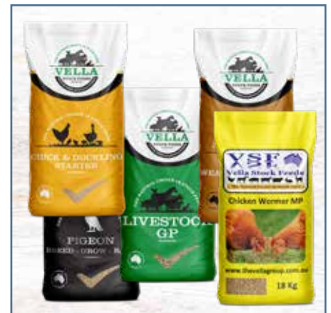
VELLA STOCK FEEDS