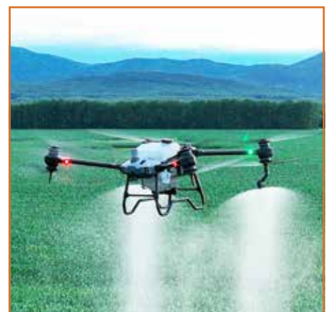
LYONAG DRONE SOLUTIONS