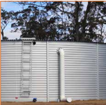
NSW WATER TANKS