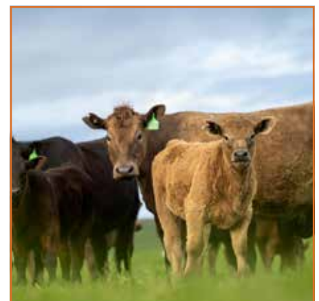
MURRIBROOK ET & RECIPIENT SERVICES