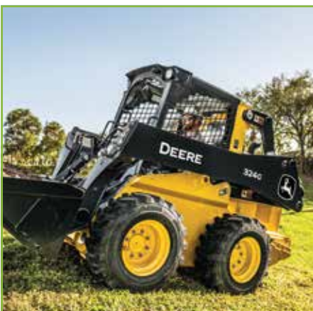
LANDHQ (JOHN DEERE)