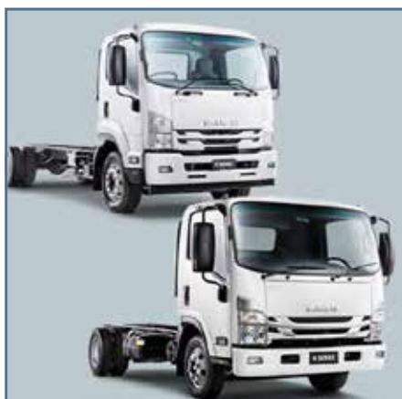
DWYERS TRUCK CENTRE