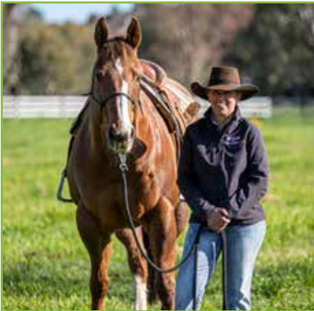
CHERRY TREE EQUINE