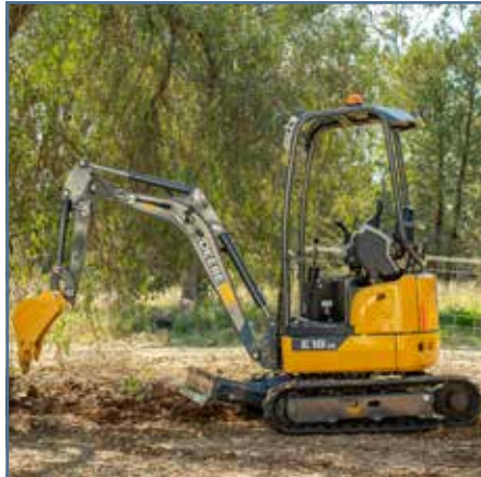
LANDHQ (JOHN DEERE)