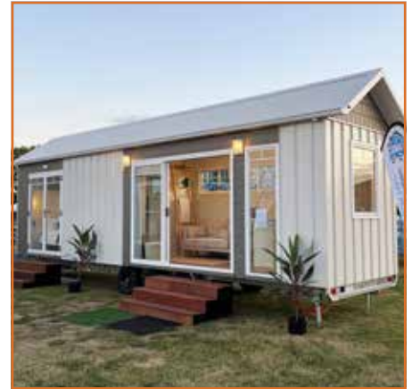
HIGHLANDS TINY HOMES