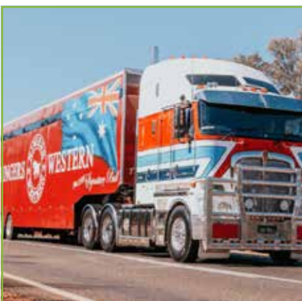
THE SIGNATURE BULL