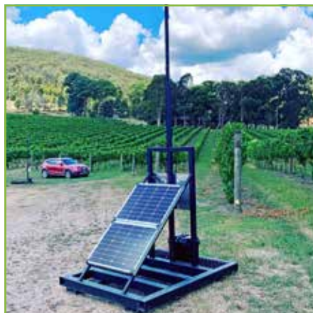
BIRD CONTROL AUSTRALIA