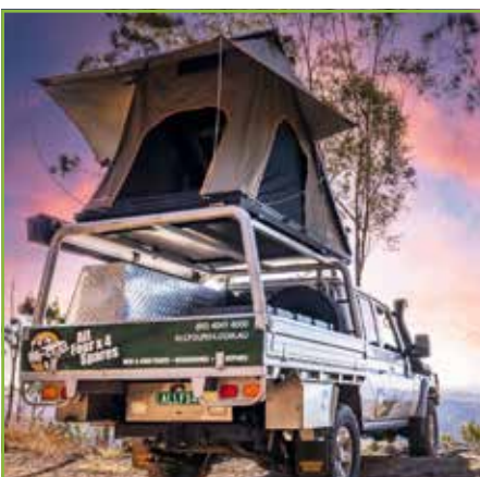
ALL FOUR X 4 SPARES